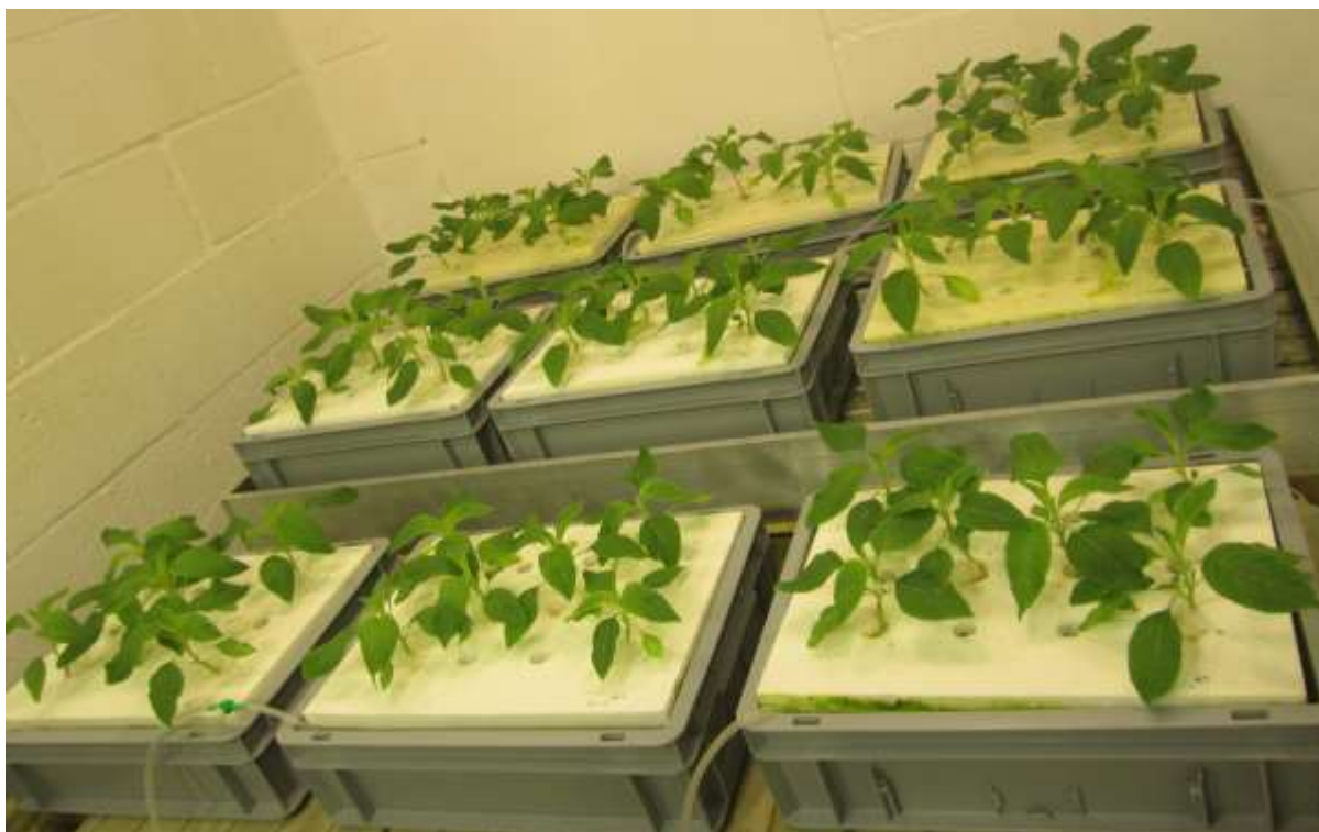
Figure 1. Experimental design with plants at the beginning of stress imposition.

carbon assimilation) was measured under a constant photosynthetic flux of photons ( 500 \mu\text{mol}\cdot\text{m}^{-2}\cdot\text{s}^{-1} ), instantaneous transpiration ( E ) and internal \text{CO}_2 content (in sub-stomatal chamber) ( C_i ) were measured on the youngest fully expanded leaf of three plants per treatment using a water vapor analyzer (LCA 2 8.7, ADC, Great Amwell, England) and an air supply unit (ASU 10.87, ADC) set up in series in an open system. The efficiency of the instantaneous carboxylation was calculated as A/C_i according to Zhang et al. (2001) whereas the intrinsic ( A/g_s ) and instantaneous ( A/E ) water use efficiency were calculated according to de Oliveira et al. (2015). To measure the osmotic potential ( \Psi_s ), roots and leaves of three plants per treatment were rapidly rinsed in deionised water, frozen in liquid nitrogen just after harvest. They were then cut in small pieces and placed in a perforated Eppendorf tube which was encased in a second intact tube. After 3 cycles of freeze/thawing, the samples were centrifuged at 15,000 g during 15 min at 4^\circ\text{C} . The extracted sap was used to measure the osmolarity ( c ) using an osmometer with steam pressure Wescor 5500 as described earlier by Lutts et al. (1999). The \Psi_s was then calculated with the following formula: